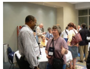
Relaxing in the hospitality room