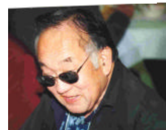
Akio Yanagihara, photographer—Captured!!!