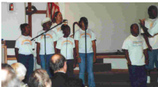
MLK AGAPE Youth Choir