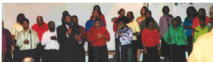
A Royal Priesthood, Guest performers at the Hurricane Relief Benefit Concert