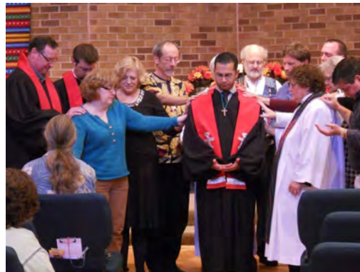
The Laying—on of hands