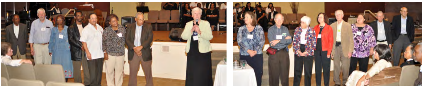
New Churches Welcomed —Calvary, San Leandro, Berkley First, SKY Ministries, and New Community of Faith. Each congregation received an “Evergreen” - etched candle holder.