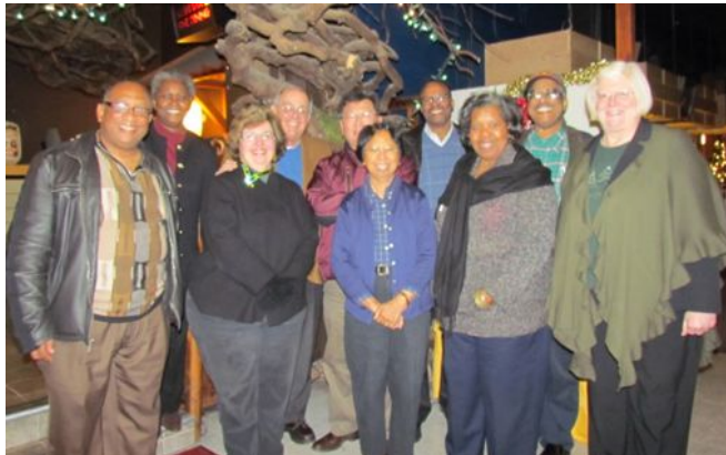
Executive Committee at Bush Garden celebrating God's goodness in 2011 and anticipating His Grace in 2012.

As the new chairperson for the Evergreen Association, I will continue the insightful