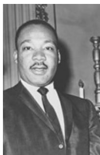
Rev. Dr. Martin L. King, Jr.