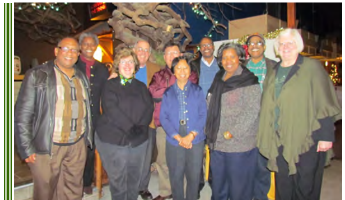
Executive Committee at Bush Garden celebrating God's goodness in 2011 and anticipating His Grace in 2012.

We hope to hear from both pastors about their experiences and learnings from this exchange.